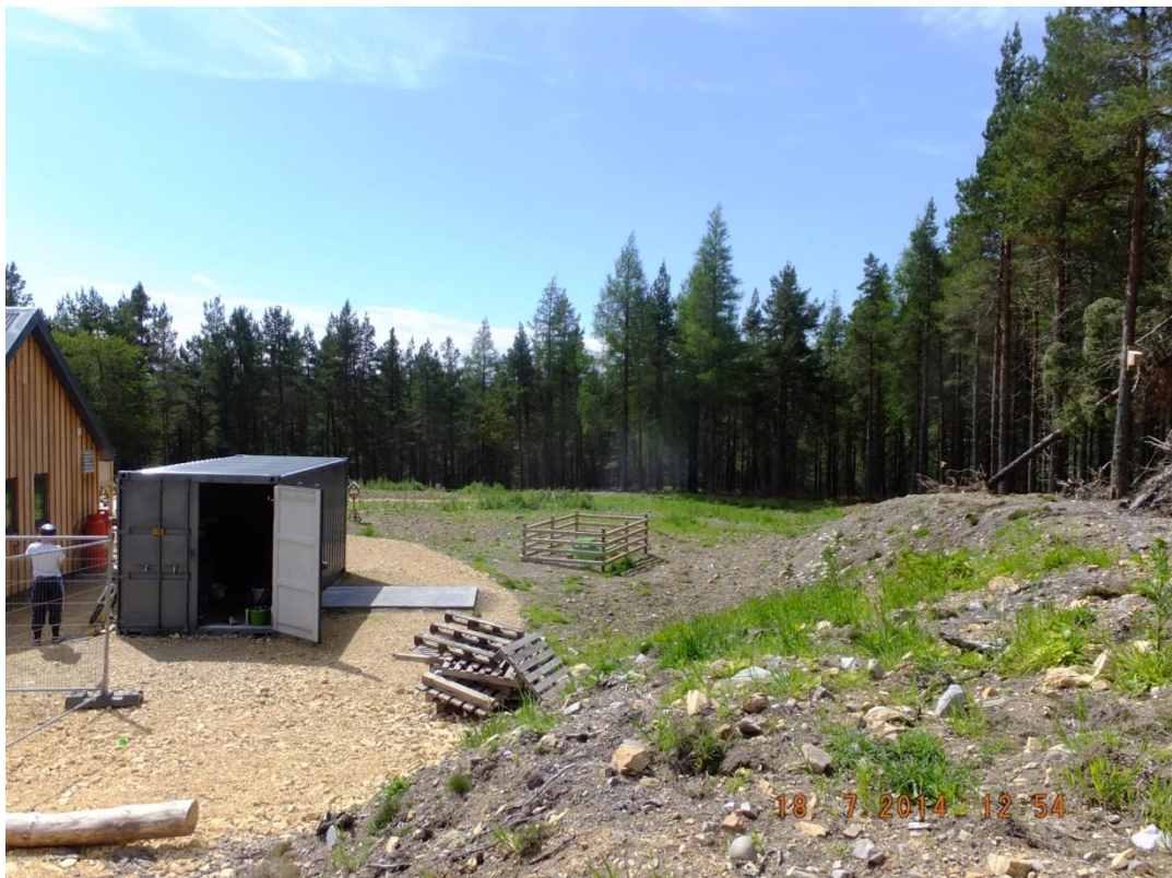
Site Facing South