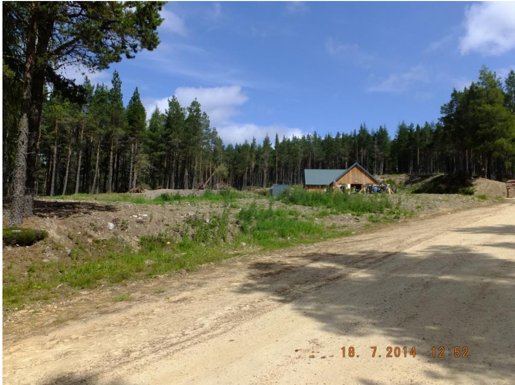
Site Facing North